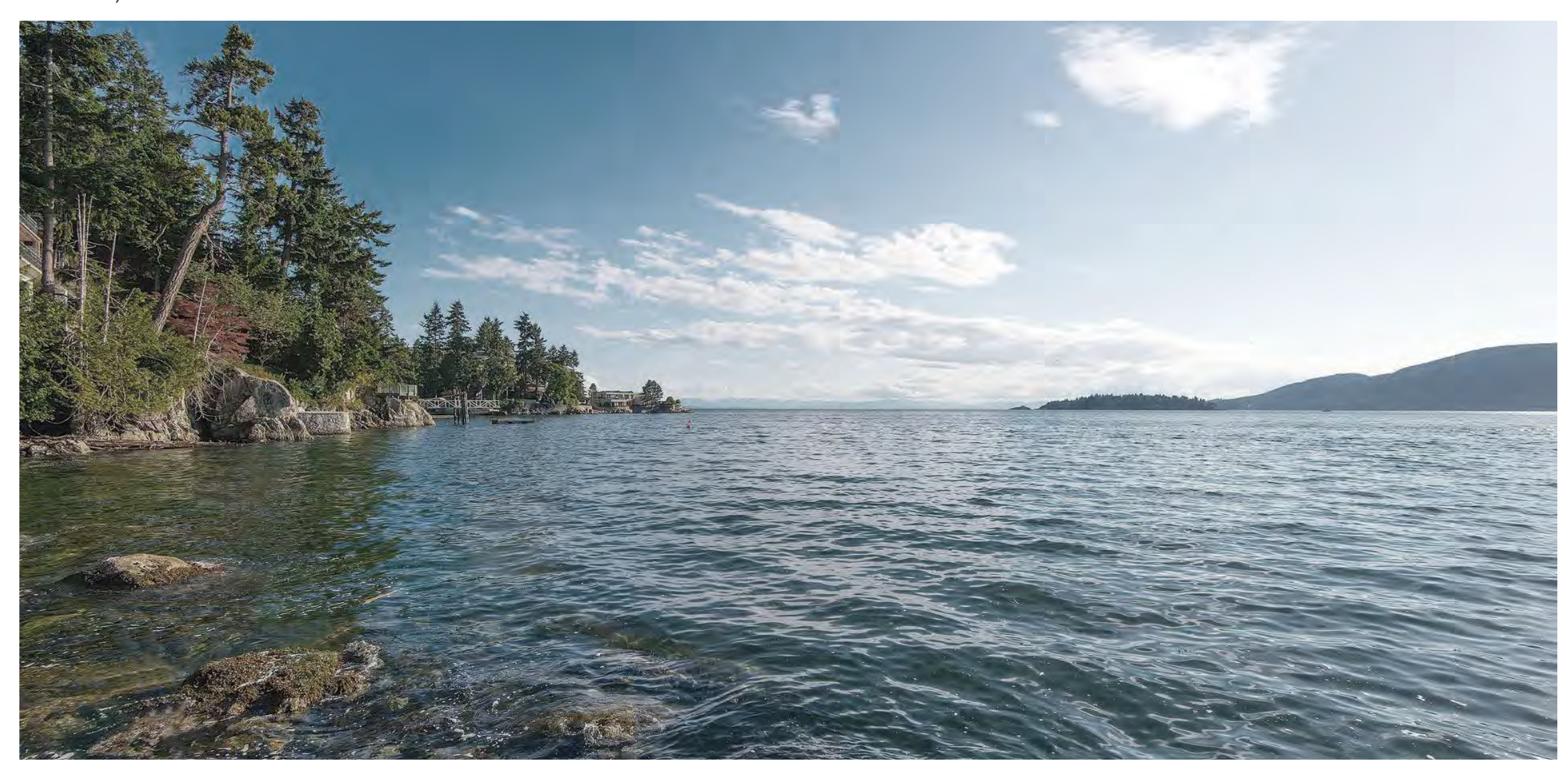
March 16, 2016