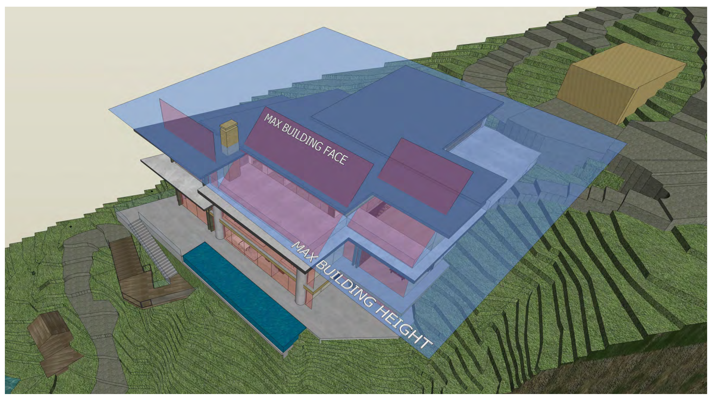
MAX BUILDING HEIGHT AND HIGHEST BUILDING FACE STUDY MODEL